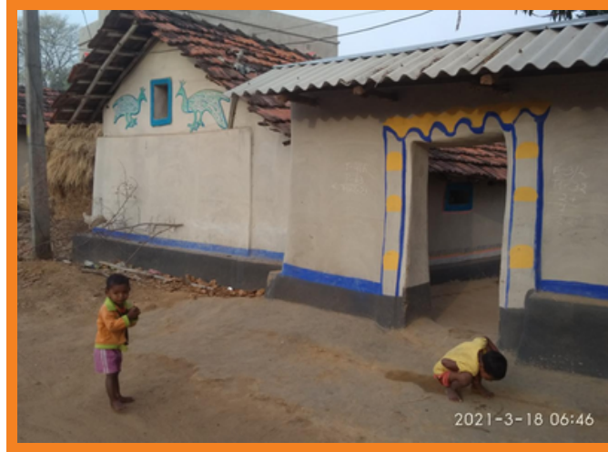
Rural living in Chhatna (a village in west Bengal)

Conclusion: As there are many issues rising, the whole world is trying to capitalize over this problem and to make this world a better place for the upcoming generation so that no people have to sleep in hunger and no people have to be homeless